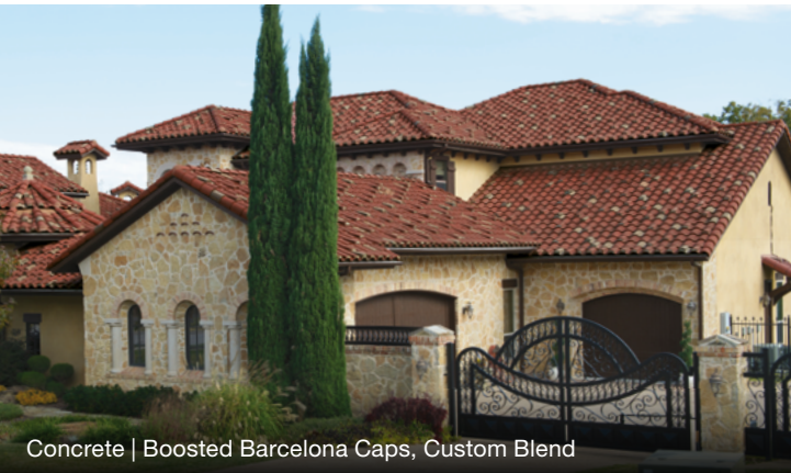
Concrete | Boosted Barcelona Caps, Custom Blend