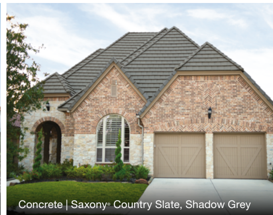
Concrete | Saxony® Country Slate, Shadow Grey