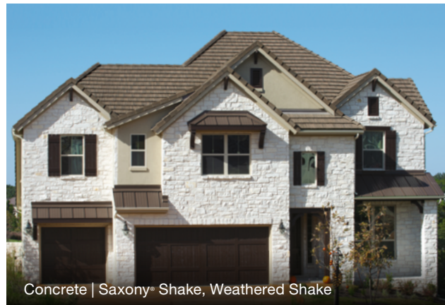
Concrete | Saxony® Shake, Weathered Shake