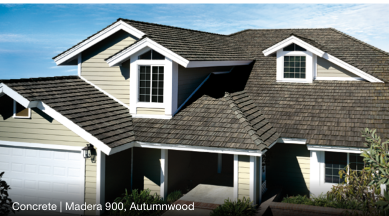
Concrete | Madera 900, Autumnwood