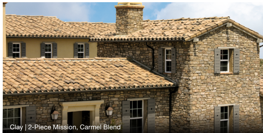
Clay | 2-Piece Mission, Carmel Blend