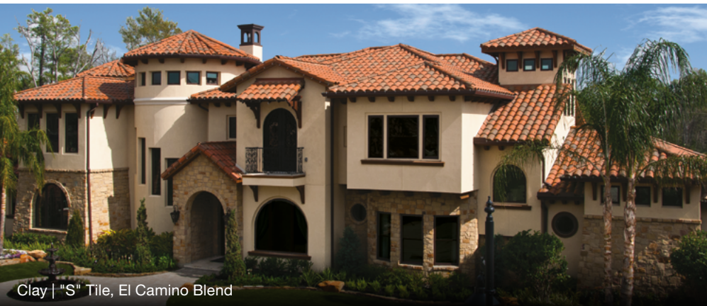
Clay | "S" Tile, El Camino Blend