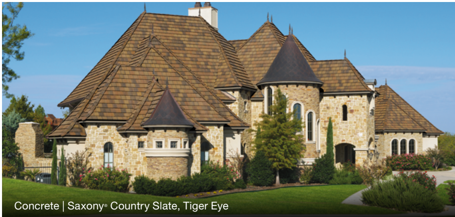
Concrete | Saxony® Country Slate, Tiger Eye