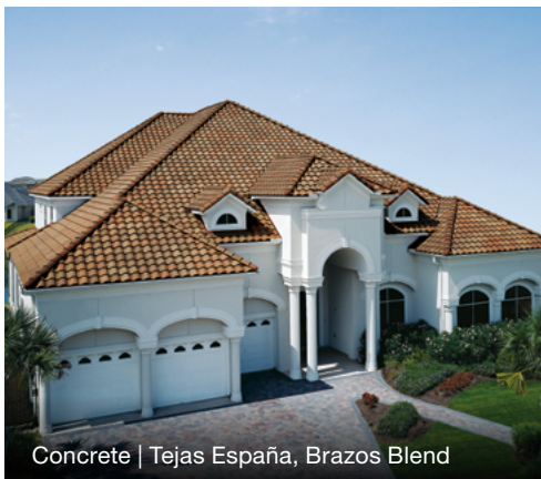
Concrete | Tejas España, Brazos Blend