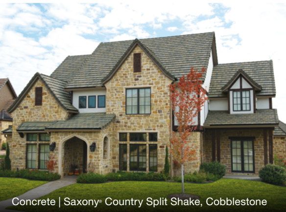
Concrete | Saxony® Country Split Shake, Cobblestone