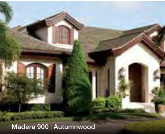
Madera 900 | Autumnwood