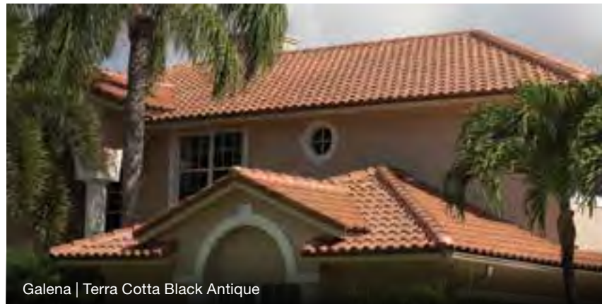
Galena | Terra Cotta Black Antique