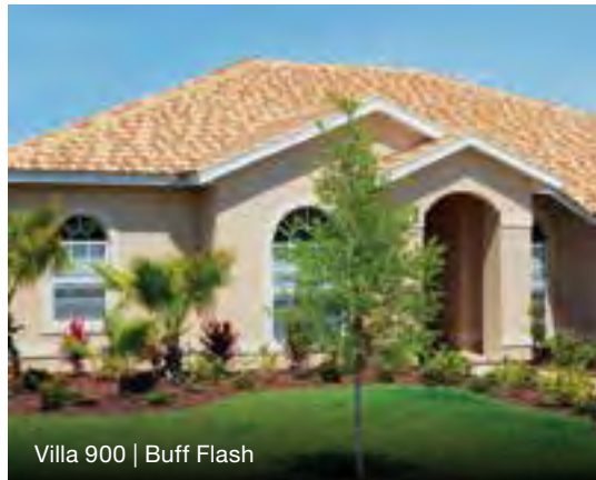
Villa 900 | Buff Flash