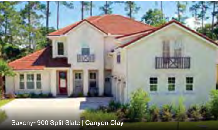
Saxony® 900 Split Slate | Canyon Clay