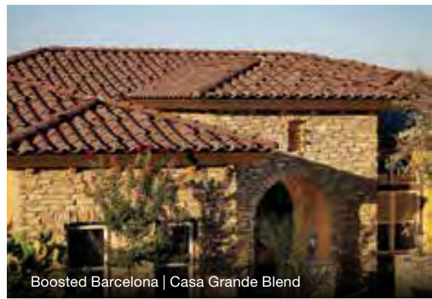
Boosted Barcelona | Casa Grande Blend