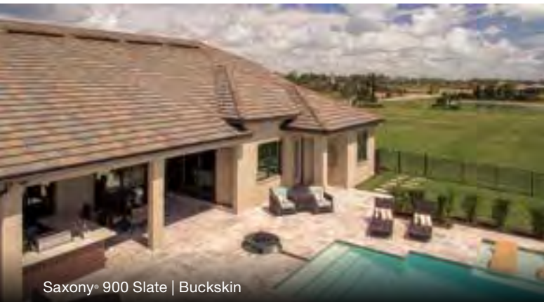
Saxony® 900 Slate | Buckskin