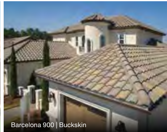
Barcelona 900 | Buckskin