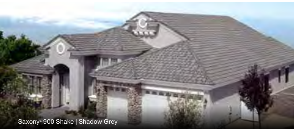
Saxony® 900 Shake | Shadow Grey