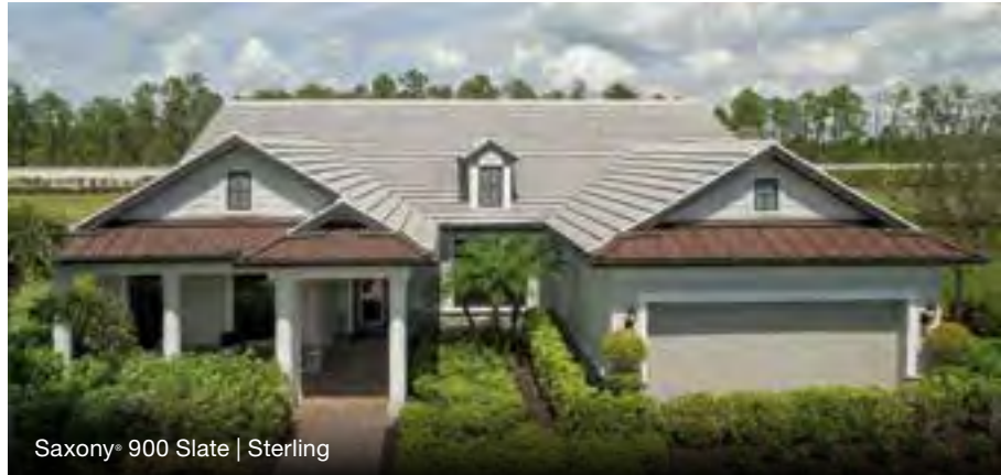
Saxony® 900 Slate | Sterling