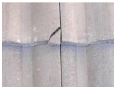
Figure 1. Broken cover lock corner