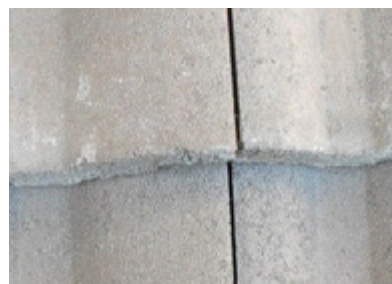
Figure 3. Properly repaired corner is not visible from the ground and maintains the water-shedding integrity of the tile. The important issue is to not use too much adhesive.