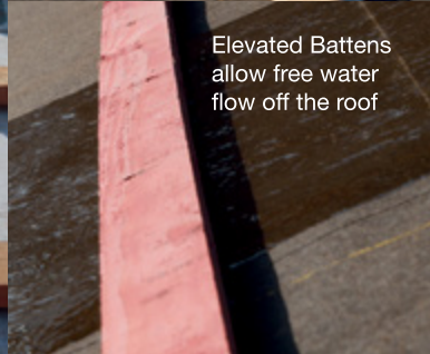
Elevated Battens allow free water flow off the roof