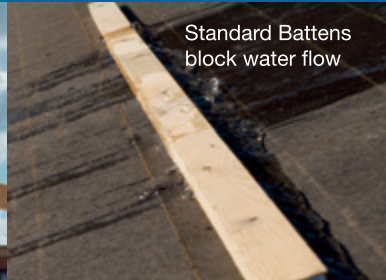
Standard Battens block water flow